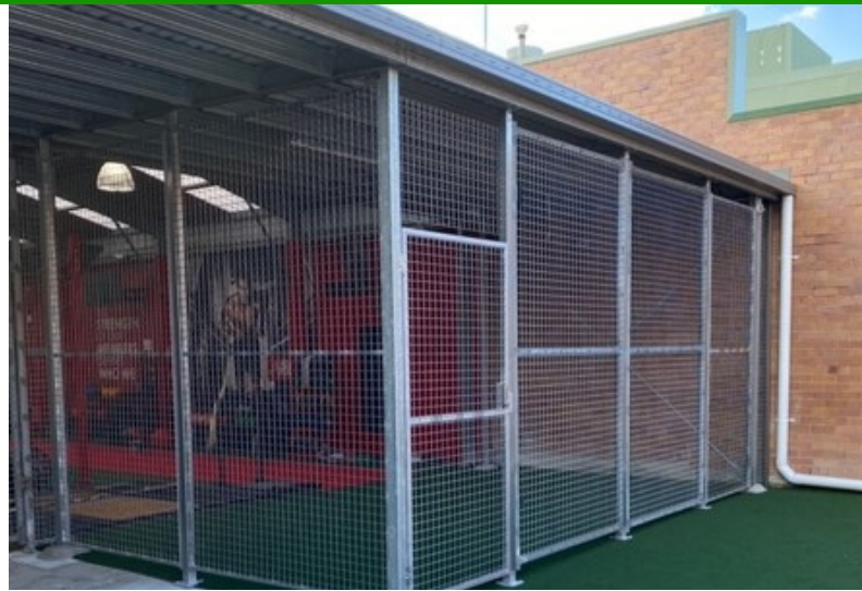
Weldmesh security cage for gym equipment.