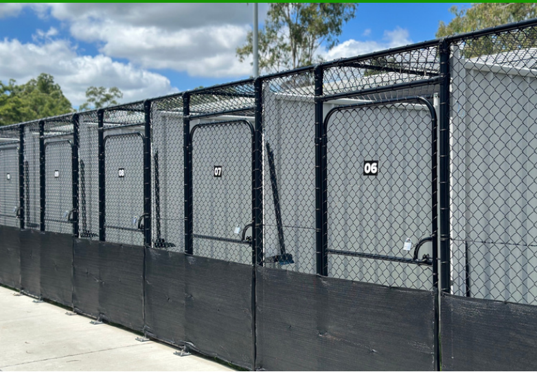
Chainwire dog enclosures with chainwire roof and 2100mm high colorbond dividers with posts set into block wall.