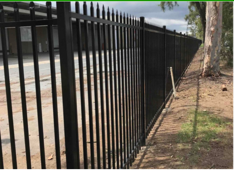
2100mm high steel security fencing for a High School