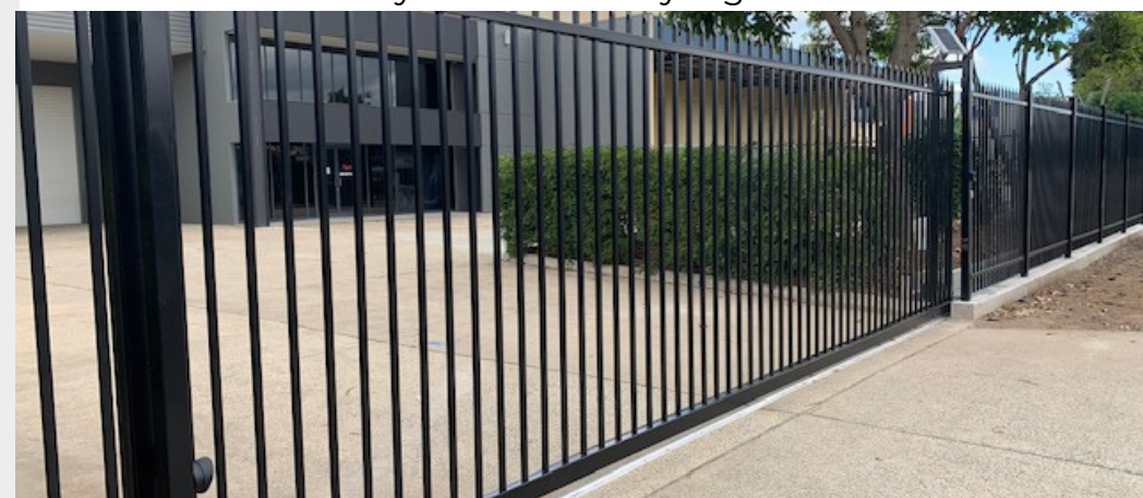
9 metre sliding gate

Raked security panels installed on concrete retaining wall built by us at inner city high school.