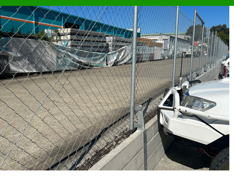
Chainwire fence on top of concrete retaining wall.