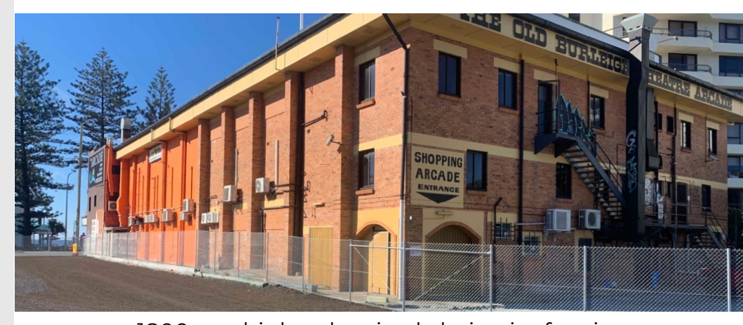
1800mm high galvanised chainwire fencing.